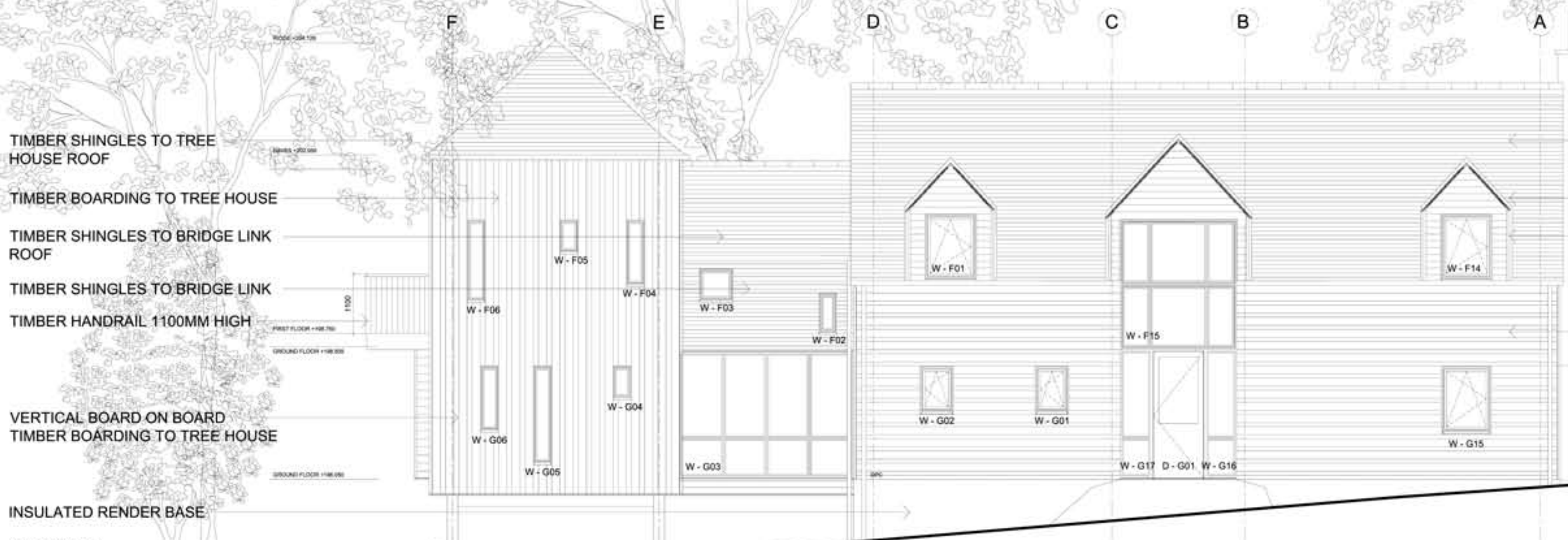
PROPOSED NORTH ELEVATION 1:50@A1